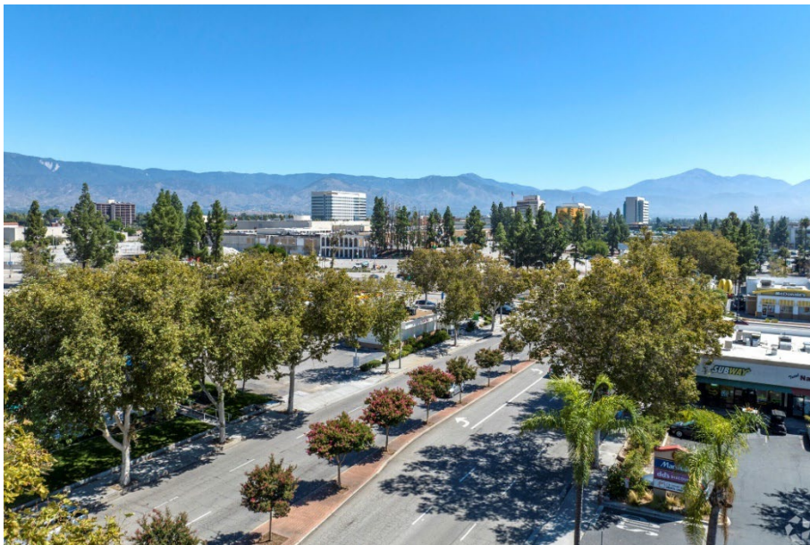
Overlooking Downtown San Bernardino

While the Public Facilities and Services Element is not a State-mandated chapter of the 2050 General Plan, civic leaders recognize that public facilities and services are key to quality of life. This element shows the City's dedication to enhancing public facilities and services as the community grows and changes over time.