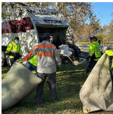
Community cleanups help to beautify neighborhoods.

The Public Works Department implements a waste management program that is designed to reduce materials that enter the landfill through waste reduction, re-use, recycling, and composting efforts. Solid waste collection, transport, and disposal are handled by a contracted private firm. The City uses a three-container system—one for recyclables, one for organic material, and one for trash. The City also implements special programs for waste tire cleanups, used oil collection, and household hazardous waste among others.