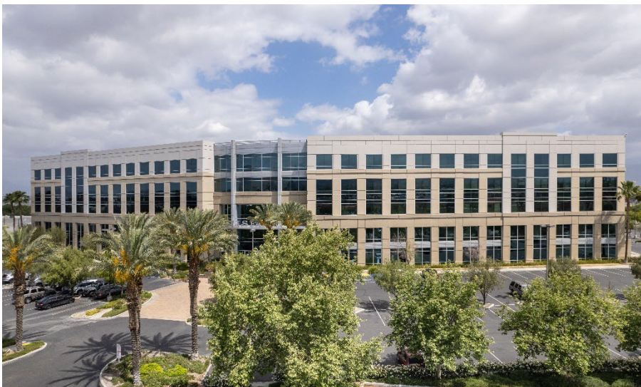
SAC Health campus, San Bernardino