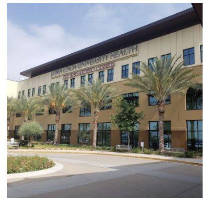
Loma Linda University Clinic

San Bernardino continues to see expansion in the healthcare sector. Loma Linda Medical Center provides a clinic and educational center. In 2022, St. Johns opened a community clinic on Waterman Avenue. In 2025, SacHealth opened a 300,000-square-foot campus at the former Wells Fargo Building in San Bernardino. IEHP also broke ground on a new Community Wellness Center to be opened in 2025. These projects augment healthcare services in San Bernardino.