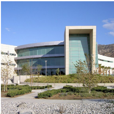
Cal State, San Bernardino

Founded in 1926, the San Bernardino Valley College (SBVC) campus is located on an 82-acre site near downtown San Bernardino. Since its original founding, the SBVC has become a key educational institution and employer in San Bernardino, enrolling 15,000 full-time equivalent students, employing more than 1,600 people, and operating a $60 million budget. SBVC has an active program to assist students graduate and transfer to four-year colleges or pursue technical educational and training. SBVC offers 200+ degrees and certificates in six career and academic pathways.