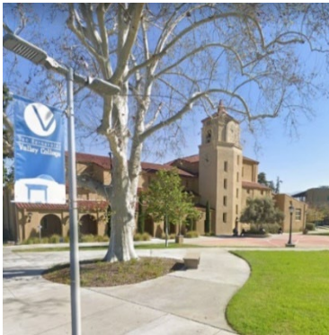
San Bernardino Valley College

Founded in 1964, the San Bernardino City Unified School District (SBCUSD) is a public school district that serves San Bernardino, western Highland, Muscoy, and a small part of Rialto. The District's mission is to ensure that all students develop the knowledge base, skills, and resilience for college, career, and civic success as well. The District has an enrollment of approximately 50,000 students, employs more than 5,000 people, and operates a budget of $1 billion—making it one of the largest school districts in California. SBCUSD is known for implementing a linked-learning approach to education.